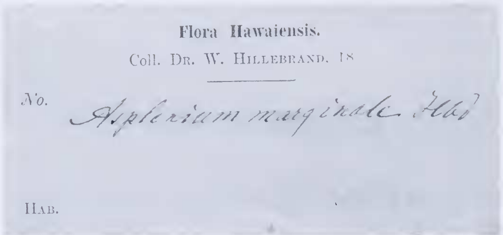
Figure 2. An example of a second kind of label found on Hillebrand's types of ferns.

cannot be known for certain when and how most of these specimens came to be at MEL as F. Mueller's correspondence was destroyed during a move of the MEL herbarium in 1934–35 (Pescott 1982). In the case of the Hillebrand collections there is contradictory information. For instance, all collections at MEL have labels stating 'Ex Museo botanico Berolinensi.' (Fig.1), leading one to believe the plants were distributed from B, and, given the consistency in the labels, that they came in one shipment. However, the pteridophytes have not only this kind of label, but also a second (Fig.2). It is possible that the ferns came in a separate shipment.